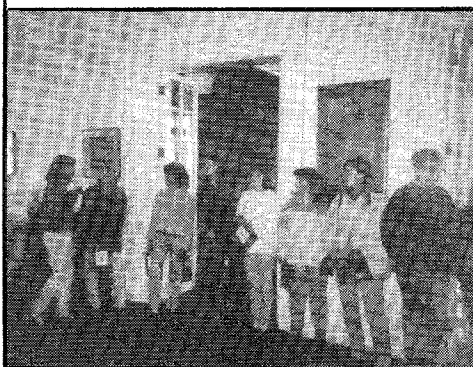
Students at Advanced Workshop last weekend in January are waiting to be put into groups.

Advanced is a workshop where all these wonderful people analyze themselves and work to understand society to help them become the strongest leaders of tomorrow.