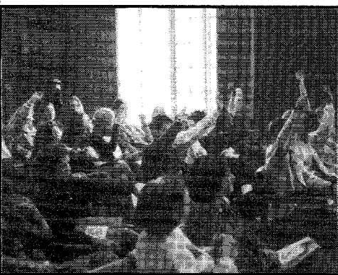
Students participating at a general session at Advanced Workshop third weekend of January.

Yea, I did and it was worth every penny of it because its not the workshop that makes Advanced great its the people. My school paid for me to hang out with some of the coolest kids in the state of Illinois for two days at the most beautiful Mansion this side of the Mississippi, and we still got back in time for the Super Bowl. Imagine meeting the author who delivered Tony LaRussa's baby, two kids going to Harvard, a man that's seen the world from Australia to France, football studs, good 'ole boys from down south, a junior with his own computer company,